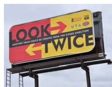
OLUTAs “Look Twice” billboard in Utah

Operation Lifesaver is currently working with TriMet in Portland, Oregon, MATA trolley cars in Memphis, TN, and the light rail in Phoenix, Arizona, to promote passenger safety around light and commuter rail tracks and trains.