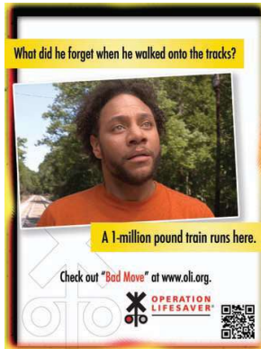
One of Operation Lifesaver's Bad Move PSA campaign posters, installed on transit lines, used QR codes to entice viewers to view the website

Austin's Capital MetroRail kicked off the transit portion of the campaign in October, while DC Metrobuses carried 150 posters for a month. Other participants were Cleveland RTA, Little Rock CAT, Nashville Music City Star, Seattle's Sound Transit, and the Texas A&M campus.