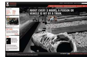
Operation Lifesaver's homepage which won a Webby Award for Best Home/Welcoming Page

Thanks to a grant from the Federal Transit Administration, OLI is increasing its emphasis on light and commuter rail safety issues. A new Passenger Rail Safety section was added to the website in 2011 to showcase OLI's work with public transit, light and commuter rail systems. The section features safety tips, best practices, and stories