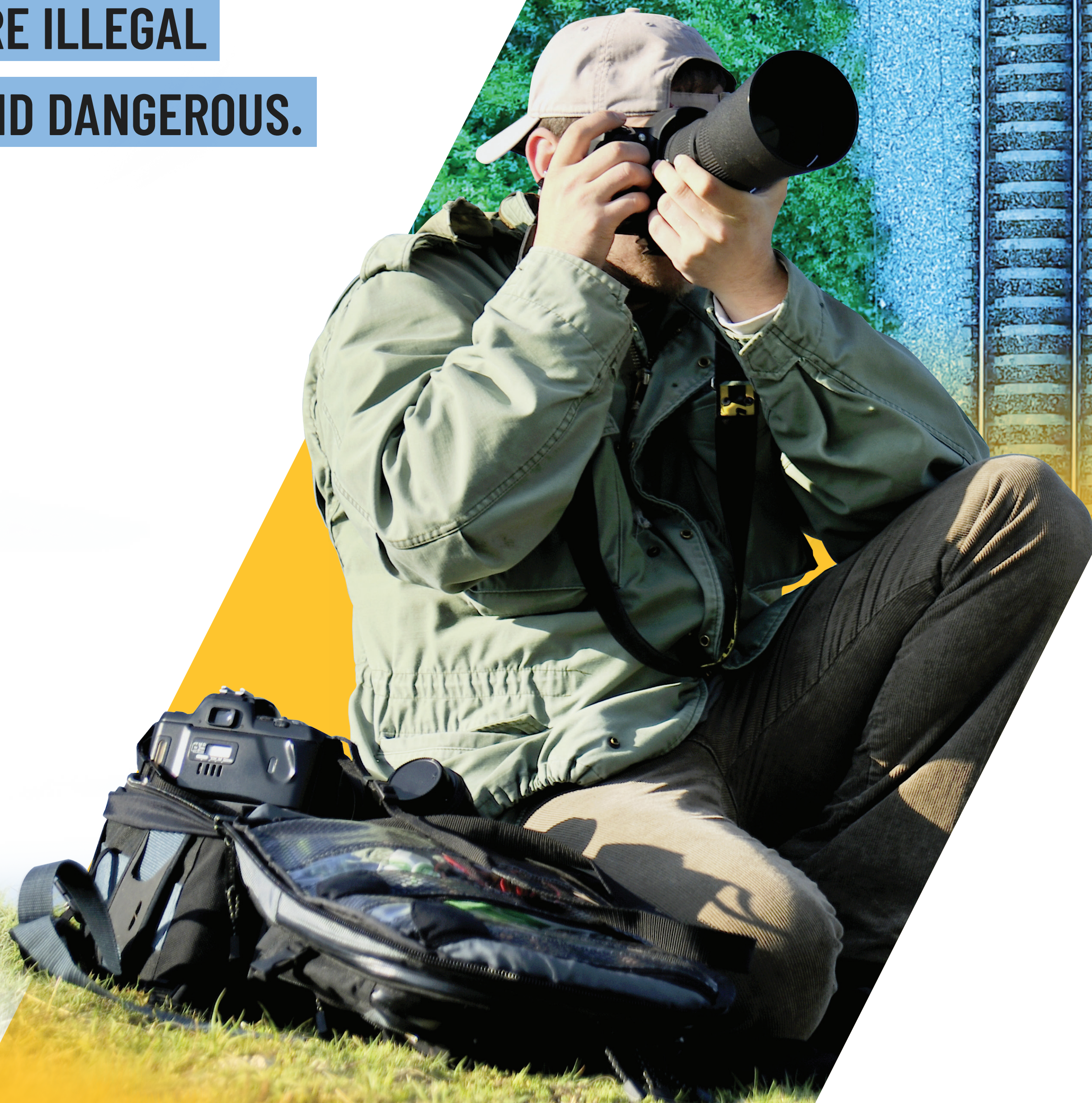
PHOTO AND VIDEO SHOOTS ON RAILROAD PROPERTY ARE ILLEGAL AND DANGEROUS.